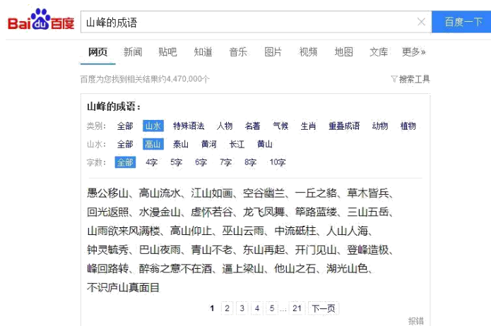
FIGURE 1. BAIDU RESULT OF "山峰的成语"

preliminarily realize idiom reverse lookup, but it simply returns idioms contain a word or a phrase in user input, rather than idioms semantic related to user query (such as in Figure 1. "山峰的成语").