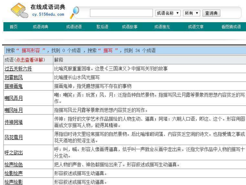
FIGURE 5. SEARCH RESULT OF "描写形容品格高尚的人的成语" OF WUYOU IDIOM DICTIONARY

For the user input query request, this paper also selects several most commonly used existing idiom retrieval system to carry out the same search, through the comparison with the existing retrieval systems to evaluate and analyze the results of the method proposed in this paper.